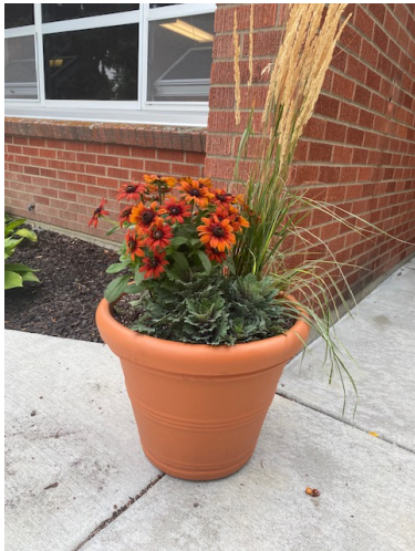
Special Thanks to Roots for providing the beautiful flowers and pots!

*Poly Drive PTA at polypta@billingssschools.org